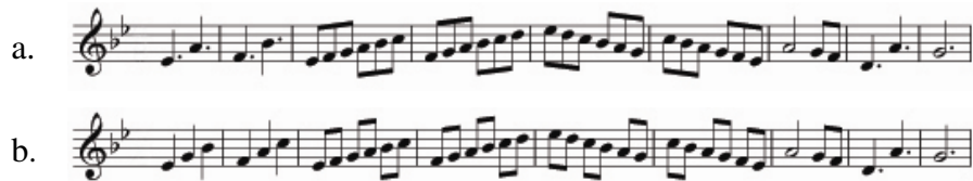
Figure 13 Metric grouping

Meter is strongly predictive: metric patterns usually remain constant and are thus a reliable basis for anticipation when subsequent events will occur, while rhythm is not a reliable basis for anticipating subsequent events, although durational patterns may be repeated (Randel 1986: 489, Sachs 1953). Meter is also continuous, which means there are no gaps between successive groups. In the case of rhythm there are often gaps between successive groups.